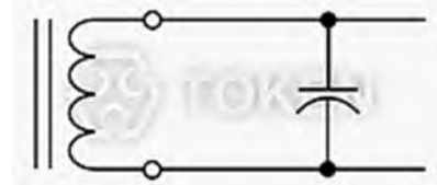
Figure 2. LC Circuit

When the transponder enters the field produced by the reader, the coil produces a voltage inside the tag. In an active transponder, the voltage is used to wake the tag and use its internal battery. In a passive transponder, this voltage can be used to power the tag. Active transponders generally have longer read distances, shorter operational life and are larger and more costly to manufacture. Passive transponders are generally smaller, have a longer life and are less expensive to manufacture.