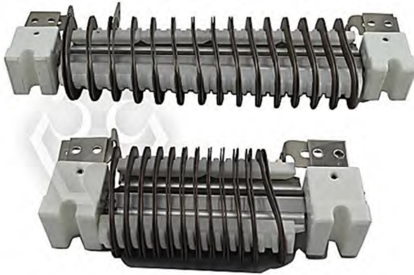
High Current Oval Edge-Wound (DOE)